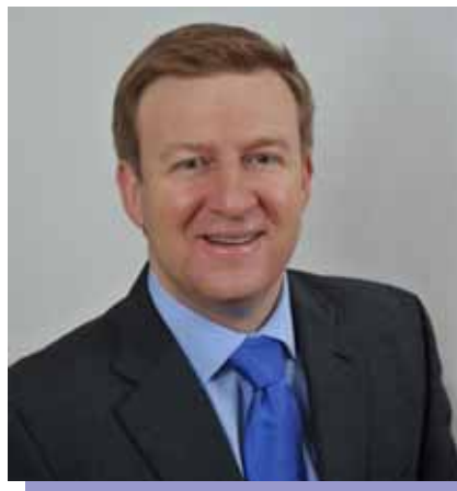
Hon. Dr Jonathan Coleman Minister of Immigration

In the case of applicants who may impose significant costs on NZ special education services, an applicant who has a condition or group of conditions , which would give them a relatively high